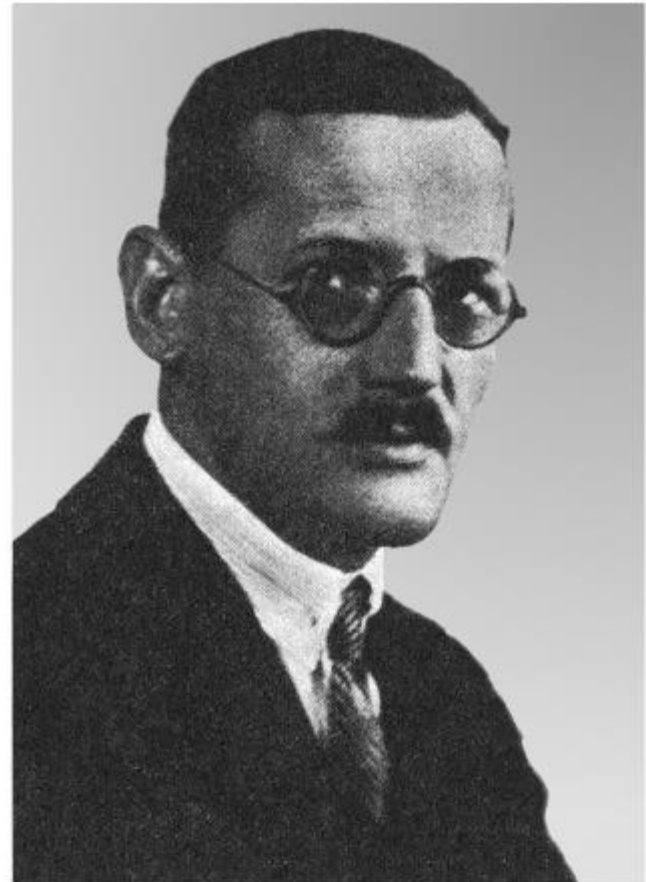
Anton Drexler, 2. Vorsitzender der D.A.P.

Anton Drexler (13 June 1884 – 24 February 1942) was a German far-right political leader of the 1920s who was instrumental in the formation of the pan-German and anti-Semitic German Workers' Party (Deutsche Arbeiterpartei – DAP), the antecedent of the Nazi Party (Nationalsozialistische Deutsche Arbeiterpartei – NSDAP).